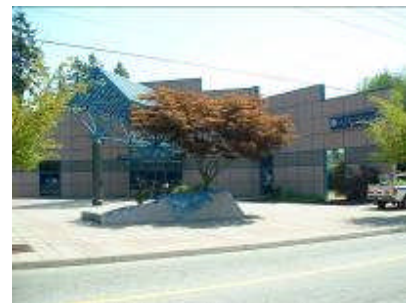
Library –Delivery Service