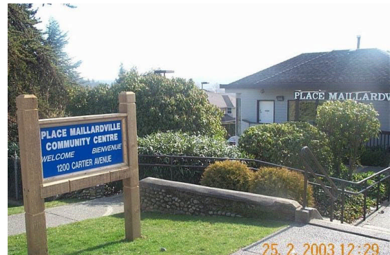
Place Maillardville - .86 km Community Centre