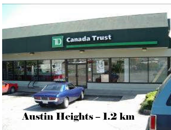
Austin Heights – 1.2 km