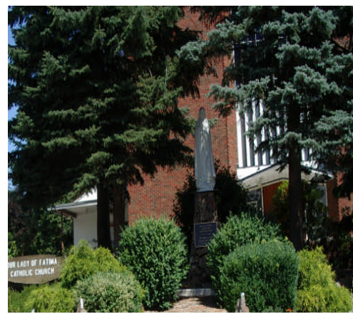
Our Lady of Fatima Parish one minute walk