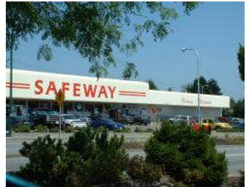
Austin Heights – 1.2 km