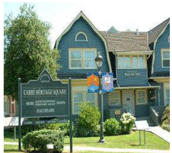
Place Des Arts