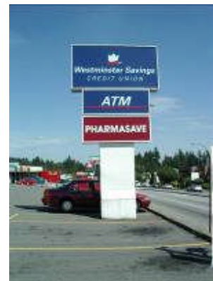
Austin Heights – 1.2 km