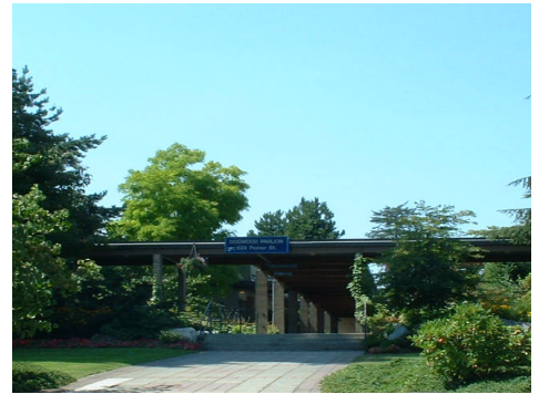
Dogwood Pavilion – 2.3 km Senior's Community Centre